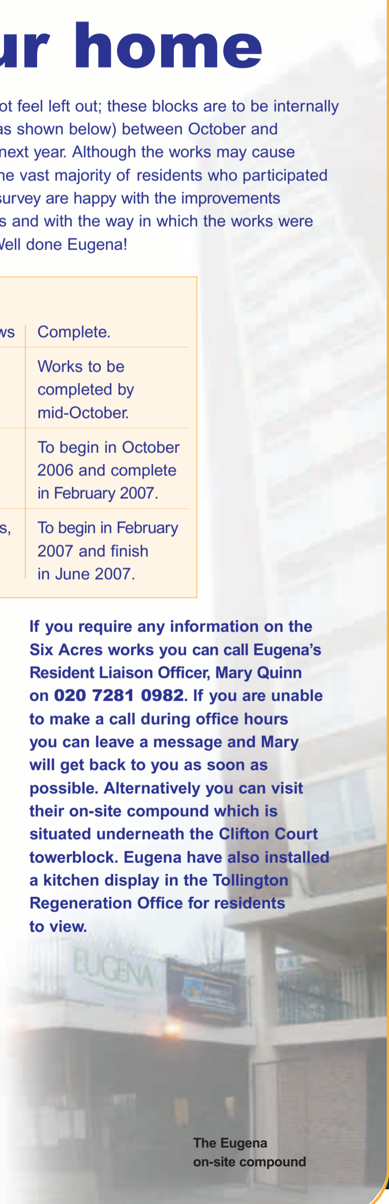
The Eugena on-site compound