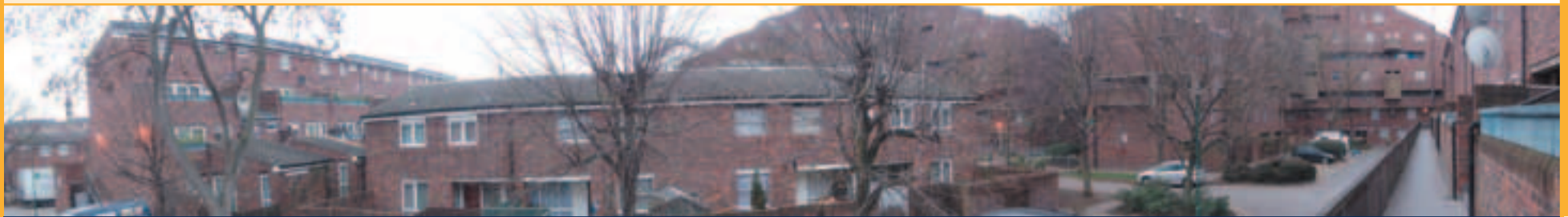
The Andover Estate