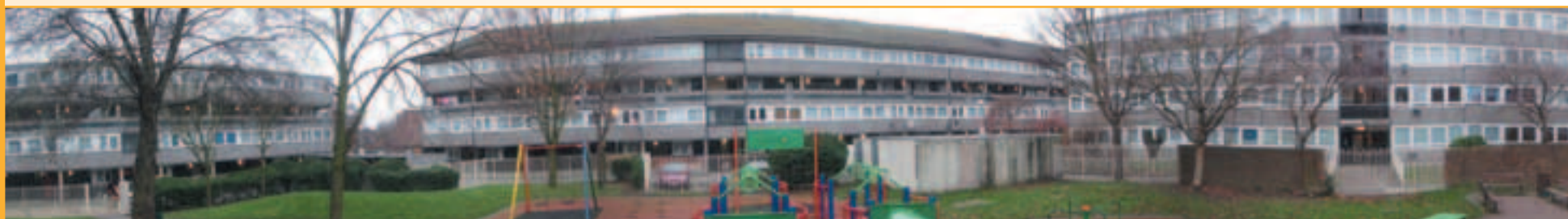
The Six Acres Estate