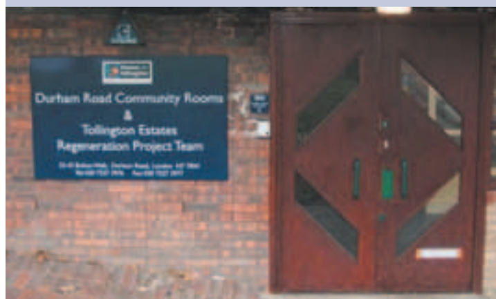
Regeneration Project Team Office

Our telephone numbers are 020 7527 3976 or 020 7527 3977