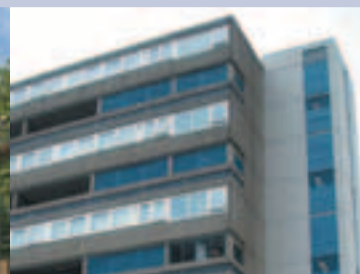
Six Acres Estate (Fyfield)