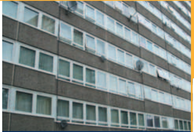
Windows at Fyfield - AFTER