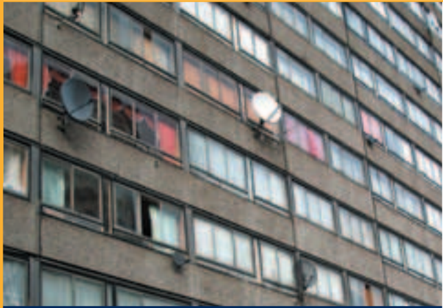
Windows at Fyfield - BEFORE