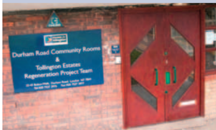
Regeneration Project Team Office

Our telephone numbers are 020 7527 3976 or 020 7527 3977