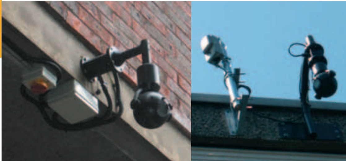
CCTV on Andover and Six Acres

Existing security cameras currently operating on the Andover and Six Acres Estates will also be included as part of a larger programme of works aimed at crime reduction.