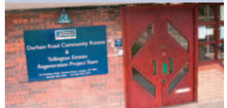
Regeneration Project Team Office