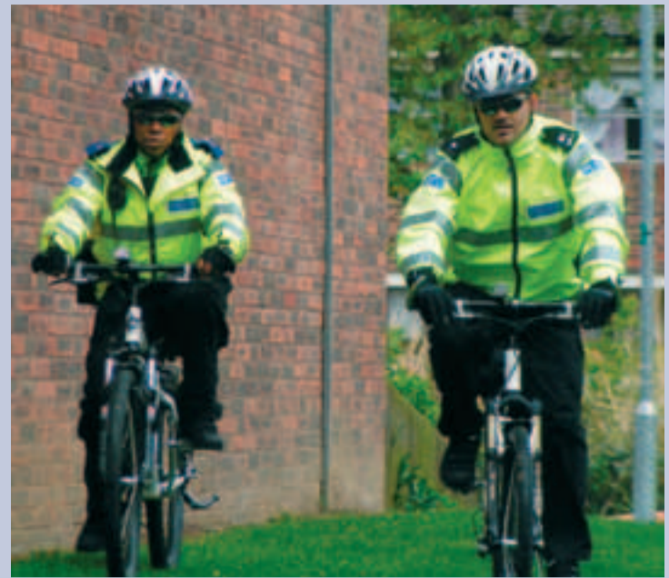
Police on patrol:

The Tollington Project Team have been working in consultation with local Police to overcome design based problems that could undermine the planned improvements to the security of the estate. CCTV and identifying the ideal type of communal security doors are just two examples of how the Tollington Project Team have been working in partnership with local Police for the benefit of the Tollington Estates.