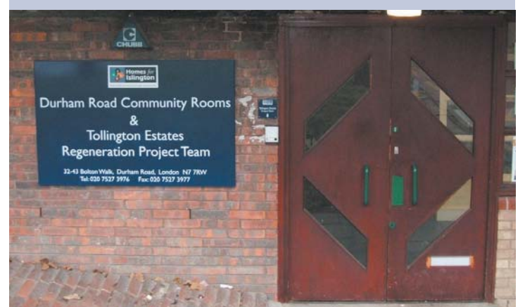
Regeneration Project Team Office

Our telephone numbers are 020 7527 3976 or 020 7527 3977