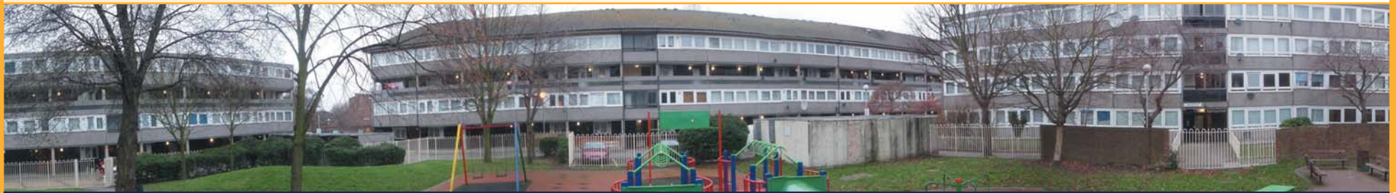
The Six Acres Estate