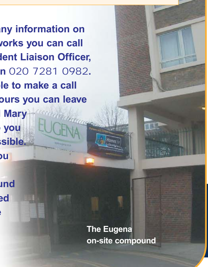
The Eugena on-site compound