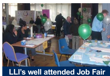
LLI's well attended Job Fair

The event was well attended by local residents and was so successful that a second Job Fair is planned for 2006.