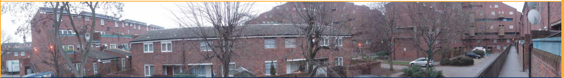
The Andover Estate