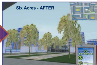
Screenshots from the 3D Computer Presentation