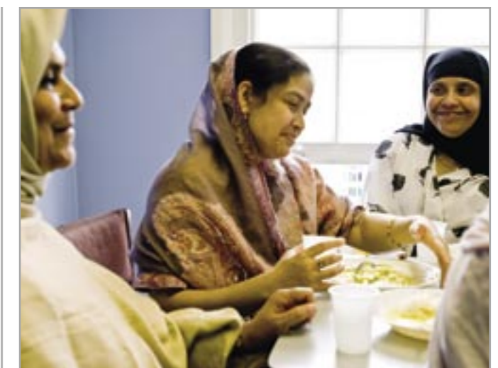
Enjoying lunch with the Islington Bangladeshi Association

In June, Homes for Islington (HFI) visited the older people's luncheon clubs at the Islington Bangladesh Association. We wanted to get some views on the services that HFI provides and how we could improve. The main areas of concern were