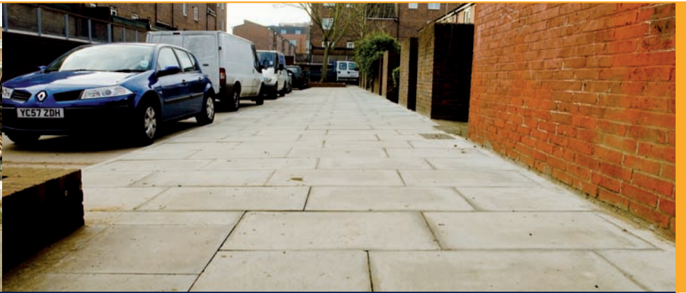
The Andover Estate