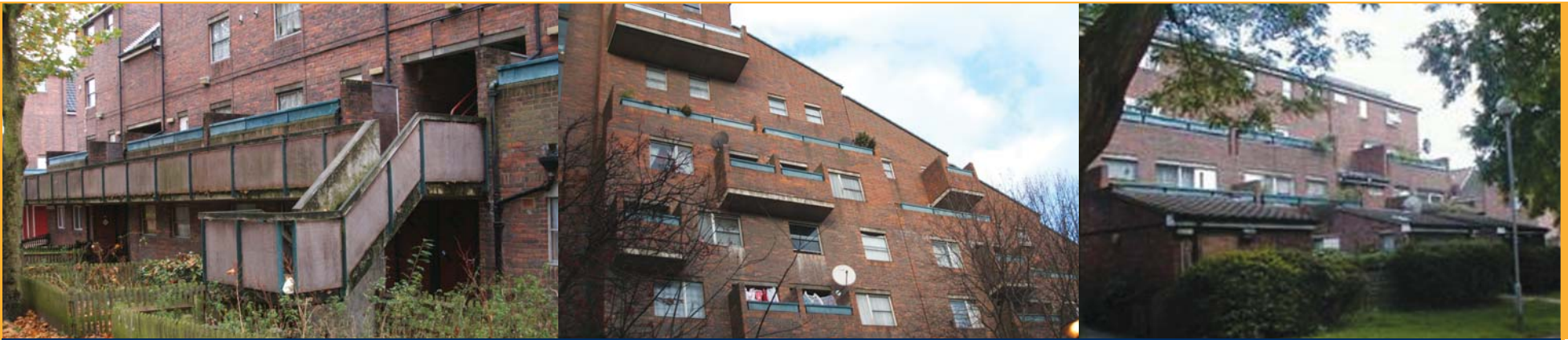
The Andover Estate